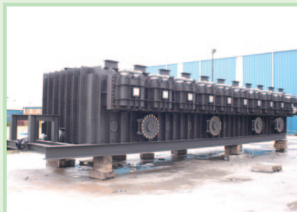
MSF evaporator made of solid duplex stainless steel, 2205, for Skikda