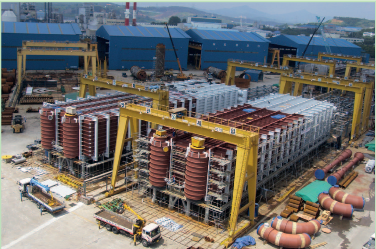
MED type evaporator of Marafiq IWPP in Saudi Arabia