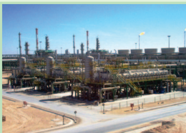
MSF evaporator made of solid duplex stainless steel, 2205, for Melittah

Lean duplex is a cost-effective duplex stainless steel which has lower nickel and molybdenum content than 2205 /1.4462. Corrosion resistance is very close to that of grade 316L/1.4404. The high strength of Lean duplex makes it possible to reduce the gauge by up to 50% compared with austenitic 300 series grades. However, restrictions in design codes limit the real savings to around 35 to 40%. 3