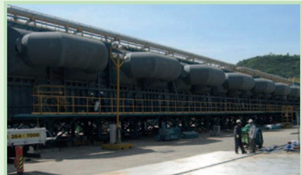
A desalination evaporator

"We use duplex stainless steels for the pipes and fittings of various water systems. Duplex stainless steels account for about 30% of the stainless used in these applications," explains Kyungkoo. "The duplex stainless steel matches the specifications of the plant's owners and is less costly than nickel-based alloys and cladding materials. In addition, duplex stainless steels resist pitting and crevice corrosion and are suited for high-chloride environments. We also use duplex grades for high-pressure piping lines, where the required mechanical strength is higher than austenitic stainless grades can provide. If delivery times for duplex stainless steels compare favourably with those of 300 grade, and maintain their cost-advantage over nickel-based materials, we will be very satisfied and will extend their use." 5