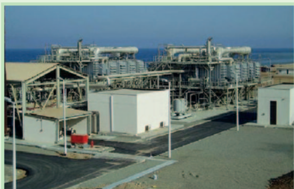
Desalination plant / Rabigh in Saudi Arabia

On the other hand, diverse types of fibre-reinforced plastic (FRP) are used, mainly for pipes in sections that become wet with low-temperature seawater. Since they do not corrode,