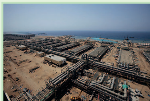
Shuaibah Desalination plant in Saudi Arabia

All desalination processes work in the same way. The incoming salt water is separated into two parts: treated and concentrate. The treated water has a very low level of salt while the concentrate has a higher level of salt than the raw seawater. An absolute necessity for the process to work is the use of corrosion-resistant materials in the construction of the plant. Material selection and design criteria are affected by the specific operating conditions the material will be exposed to during its lifetime. Many of these criteria are perfectly met by stainless steel. Stainless should be utilised wherever corrosion resistance and durability are key requirements.