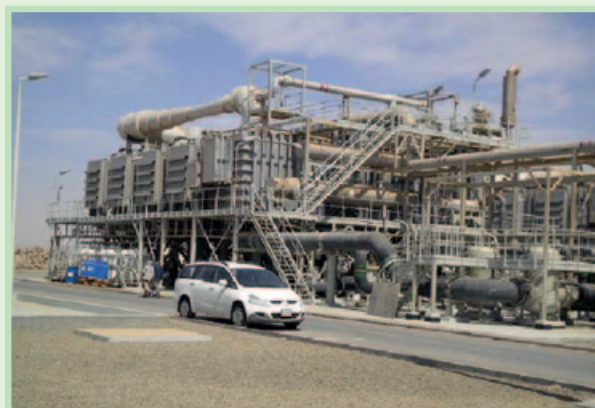
Desalination plant / Rabigh in Saudi Arabia

there is no problem with their reliability in this application. To date they have not been used for other applications such as evaporator vessels, pumps or large storage tanks. Plastic pipes are not used for high-pressure piping since their pressure- and heat-resistance properties are not high enough.