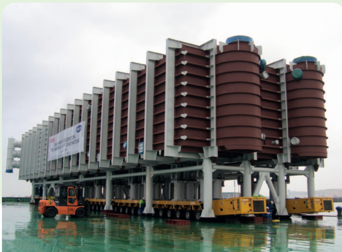
MED type evaporator of Marafiq IWPP in Saudi Arabia