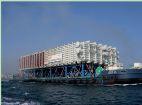
MED type evaporator of Marafiq IWPP in Saudi Arabia

6 The dual duplex concept has already been implemented in large MED plants. The first such example was erected by Sidem in Sharjah, United Arab Emirates (UAE). The grades used in the plant are 2205/1.4462 in combination with 2304/1.4362. 2